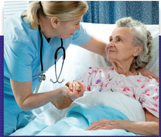
Ensure safe staffing levels

Balance your patient acuity needs and clinical skills with CareConnect™ from Concerro™. To ensure safe staffing levels, our unique methodology enables your organization to systematically formulate and implement a set of patient attributes that are customized to your patient populations served. This allows us to identify the best predictors of patient care and workload for your practices and your patient mix.