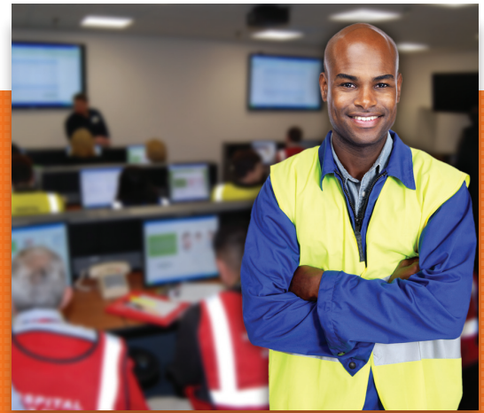
Assess situations and communicate instantly

CommandAware® is a secure virtual command center that helps emergency preparedness coordinators and administration make better decisions during all four phases of disaster management including preparation, mitigation, response and recovery. With CommandAware as a common communications framework, the Incident Command System team can manage response capabilities and capture critical data essential to coordinating emergency response.